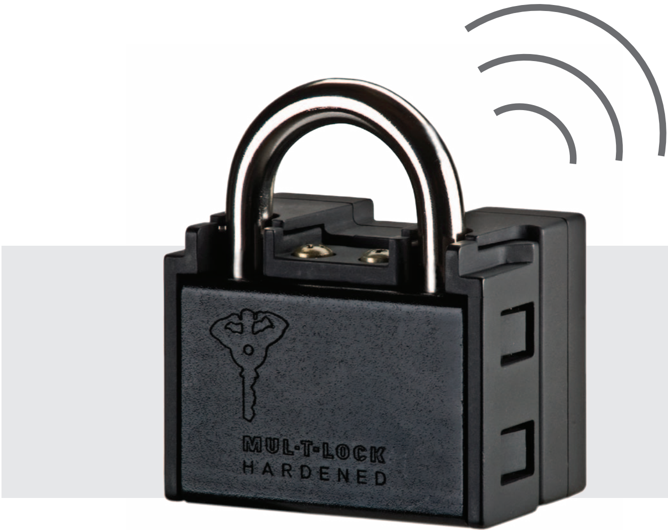
©2013 Mul-T-Lock Technologies Ltd. and Starcom Systems Ltd. - GPS Tracking Systems 89101894 - B